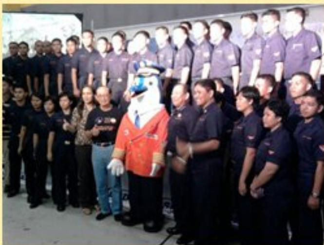
Former Philippine President Fidel V. Ramos with the members of the Philippine Coast Guard at the Manila Aqua Marine & Aquatic Resources Exposition (MAMARE) in Pasay City